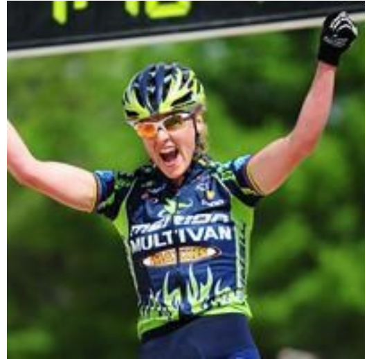
Gunn Rita Dahle-Flesjå (Multivan Merida) is elated with her first major victory

"I could never have imagined taking this amazing victory today, it is like winning ten World Championships to me," said the happy Norwegian.