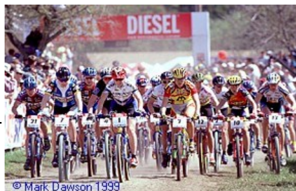
Napa, 27 April, 1999. Women's start

This is Dunlap's second world cup round victory. Her first was at Budapest in 1997. Dahle had distinguished herself a couple of weeks ago at round two of the road racing women's world cup