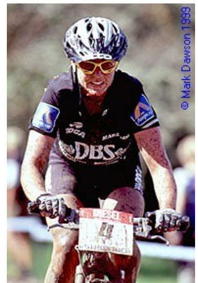
Gunn-Rita Dahle. This year she is the world's most successful on and off-road rider