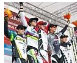
Elite men's downhill podium

However, Hill was still to come, and he was everyone's favourite, after showing he was clearly in tune with this track, both in training and qualifying. The favouritism looked to be justified, when the Australian went through the upper portion 1.6 seconds faster than Peat, and enter the final sections two seconds ahead. But then disaster in the form of a crash in the woods, and Hill's chance for his first win of the year disappeared, while Peat saw his dream of a World Cup record realized.