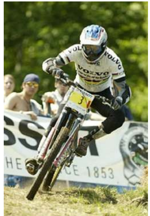
Anne-Caroline Chausson, FRA