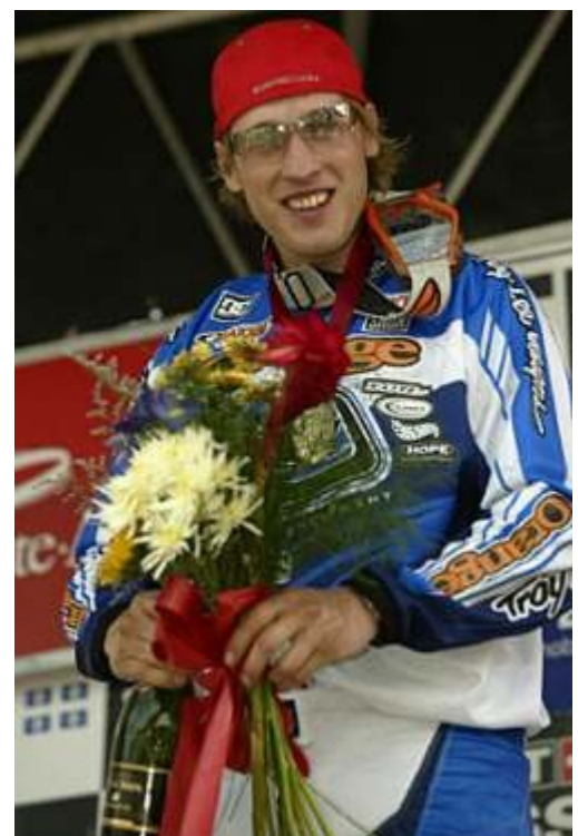
Steve Peat, GBR